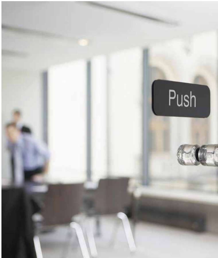
BEFORE - NO HDCLEAR