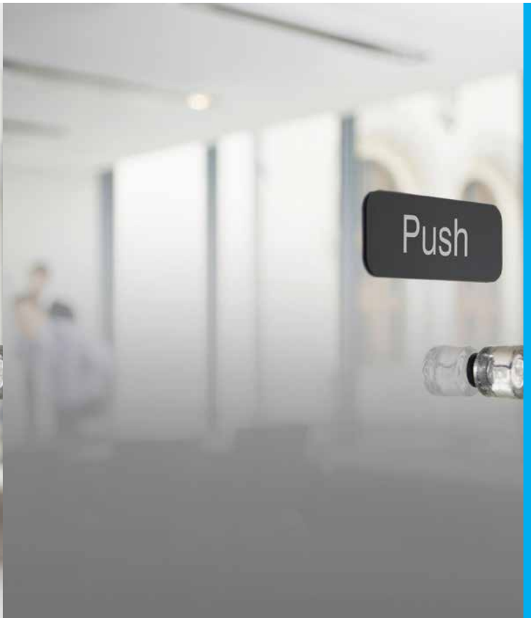
AFTER - HDCLEAR CUSTOM FROST FINE FADE